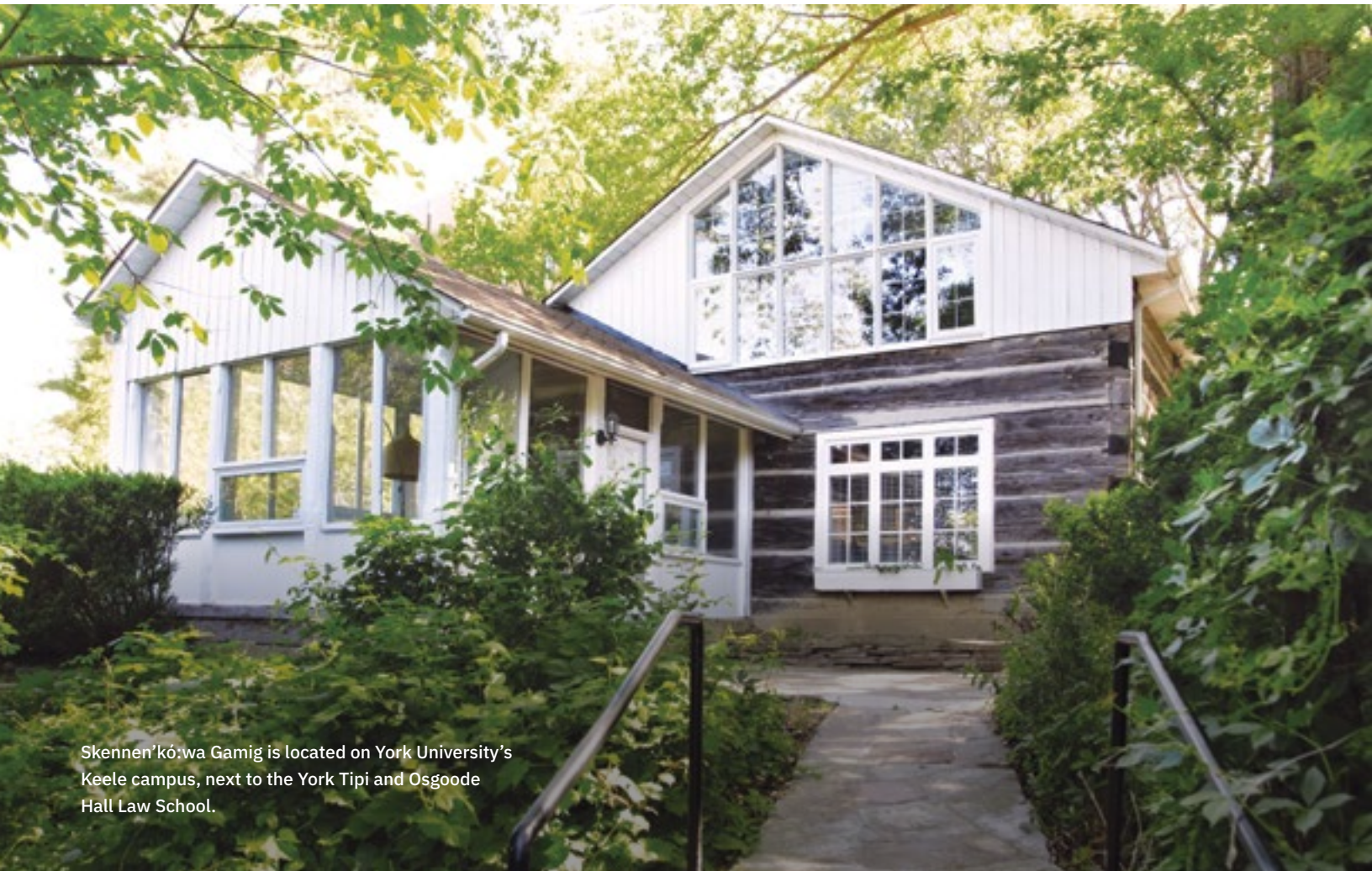
Skennen'kó:wa Gamig is located on York University's Keele campus, next to the York Tipi and Osgoode Hall Law School.

The name Skennen'kó:wa Gamig comes from both the Mohawk and Anishinaabe languages. Skennen'kó:wa means "Great Peace," a cultural teaching that refers to the basis of the Haudenosaunee Confederacy. The Great Peace are the laws and responsibilities that Haudenosaunee people aspire to live by. Gamig is an Anishinaabemowin word that means "home" or "house." We see the house as a space where students, staff and faculty can "come home" to a peaceful environment on their journey through university life.