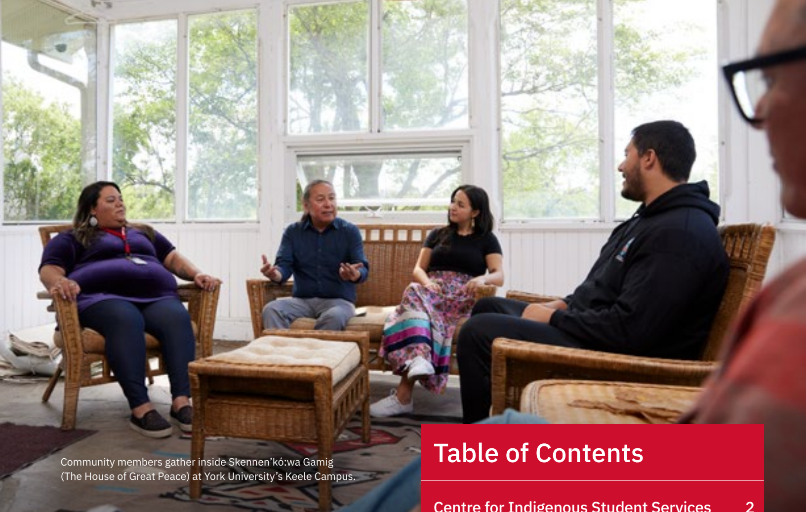
Community members gather inside Skennen'kó:wa Gamig (The House of Great Peace) at York University's Keele Campus.

Amazing things happen when diverse communities work together to create positive change.