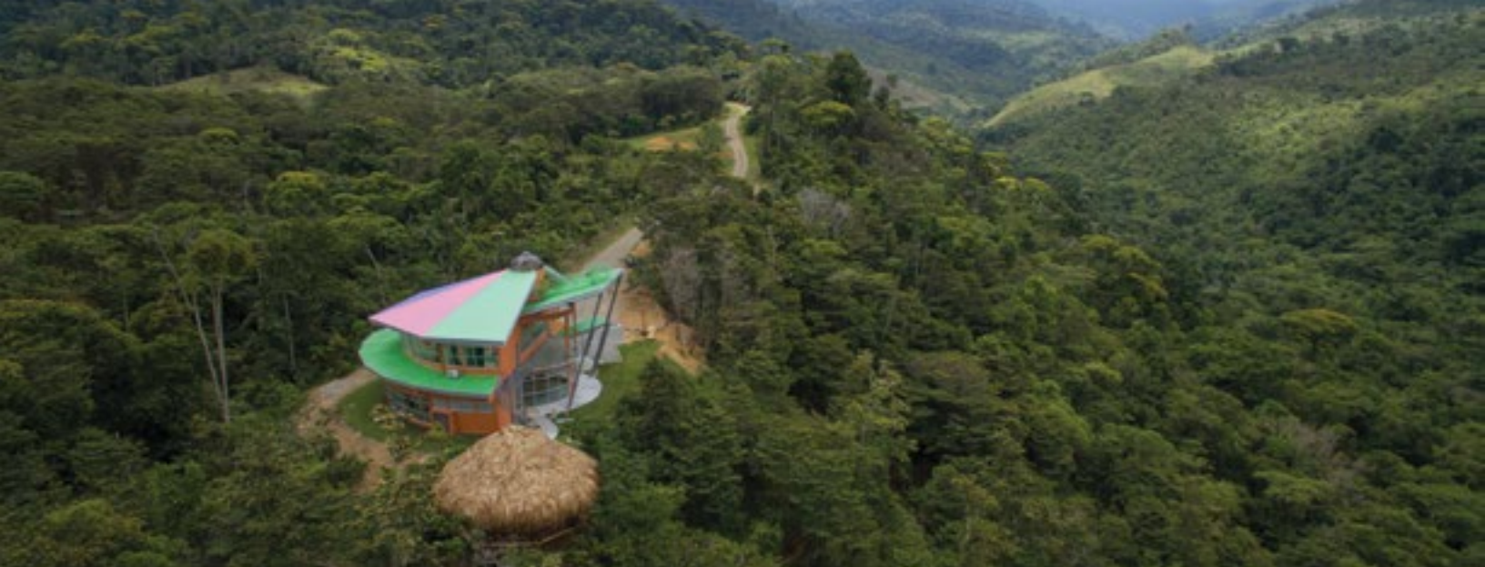
The Faculty's Las Nubes EcoCampus

and educational practice. Through creativity, collaboration, critical analysis, and hands-on community engagement, learn how we can envision and realize a just and sustainable future. Career paths include: environmental lawyer, policy developer, artist, designer.